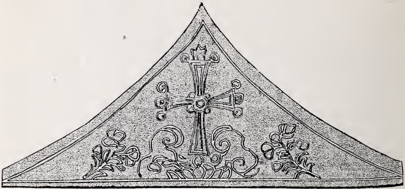
THE CROSS ON THE NESTORIAN STONE.

The original Nestorian tablet of A. D. 781, as well as my replica, made in 1907, are both carved from the stone quarries of